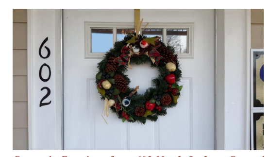
Season's Greetings from 602 North Jackson Street!